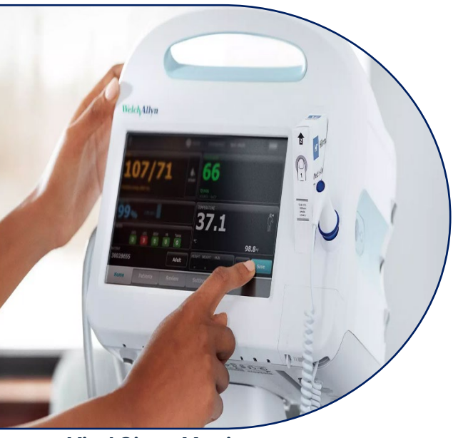
Vital Signs Monitor

Unexpected delays can lead to inefficiencies, increased costs, and potential equipment failures. That's why we offer a Special Project Solution designed to assist your team in completing overdue maintenance—without straining your budget.